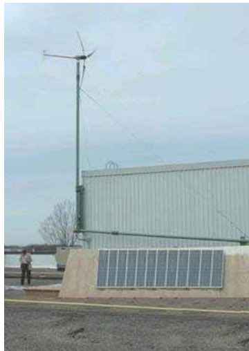
The CDDHS Wind Turbine and Solar Panels, on the school roof

Saturday June 4th 8:30am to 12noon Grace Tipling Hall Doors open at 8:00am refreshments provided