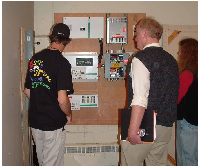
CDDHS Student Leader demonstrates the control panel for the Green Power Project, including metering equipment, inverter and “grid tie” system